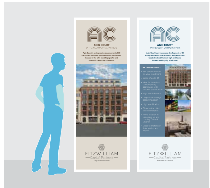
Above: Branding, brochure covers, pullup stands, email template and launch event. Opposite: Brochure cover and spread.